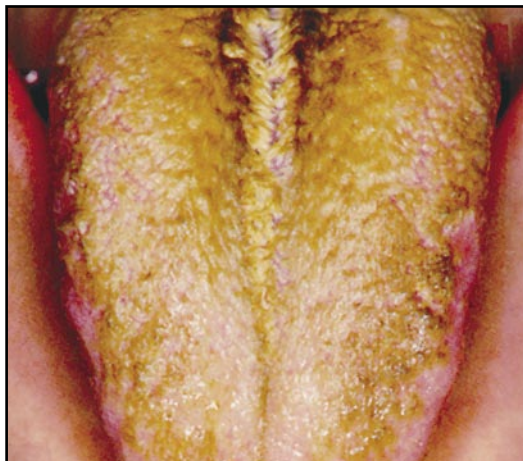
Hairy Tongue and heavy overgrowth in a tobacco user.

P revent this from happening to you and be a positive role model for the next generation by beating tobacco abuse.