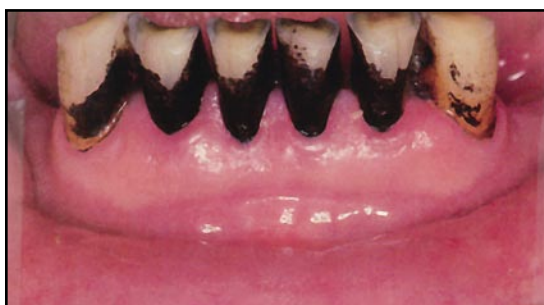
Mouth of a tobacco user.

Chemicals from iqmik go into the blood stream through the lining of your mouth.