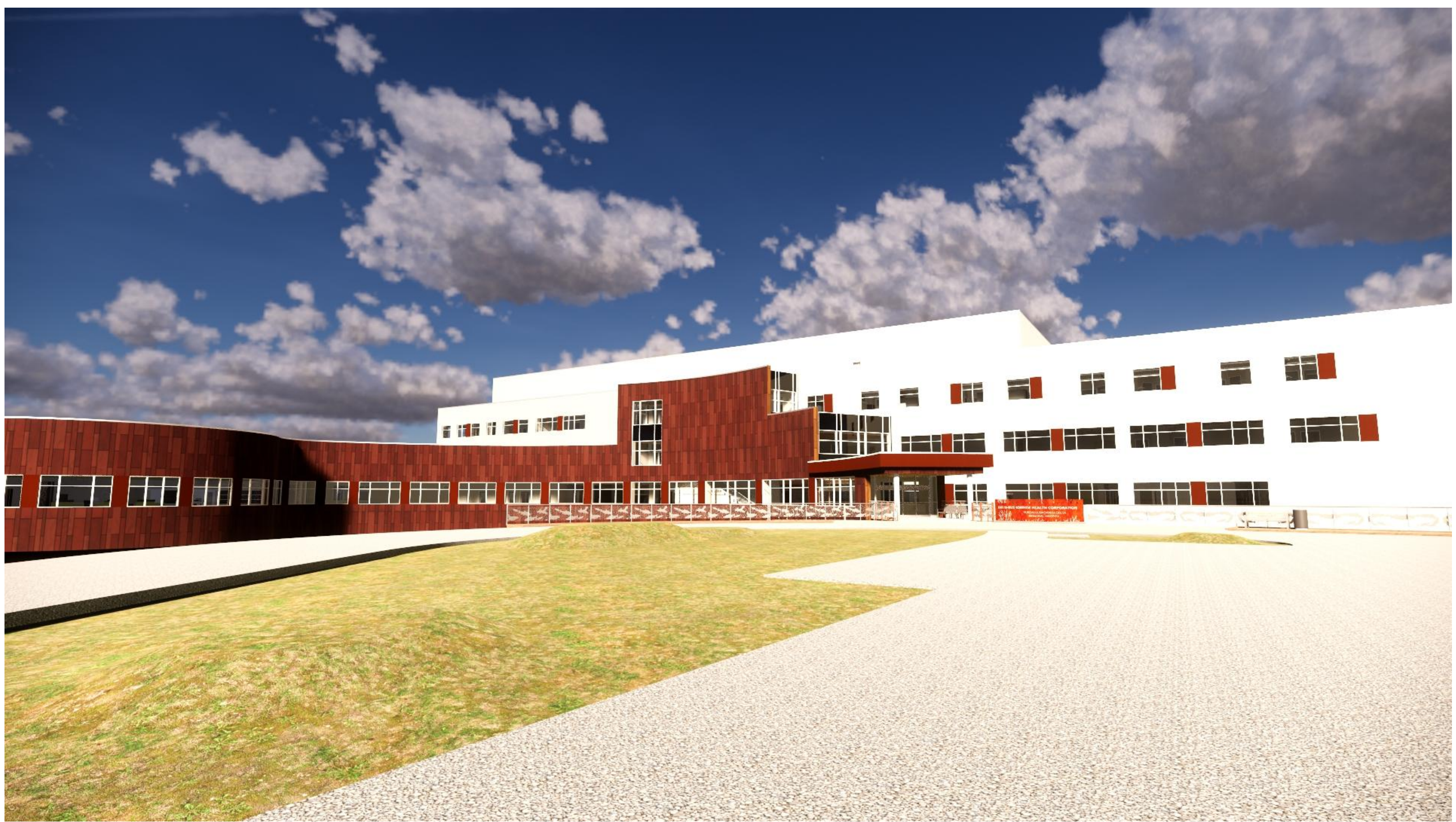
Exterior Rendering for Artist reference - Trees not Shown